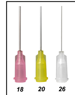
Needle Gauge (GA)